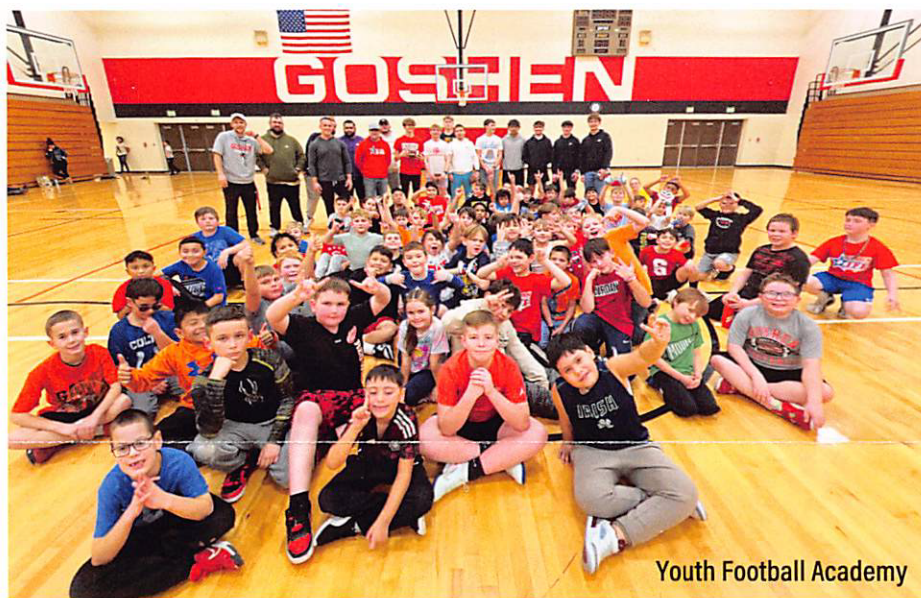
Youth Football Academy

This winter and spring we launched new and exciting opportunities to continue to grow Goshen football. In the winter we hosted a free Youth Football Academy on Monday evenings at the Jr. High where elementary and junior high school kids could come and learn the game and be taught by our players. This was a huge success and something we will continue to do. We had more than 80 kids show up each week to get better at football. We also started a Spring Flag Football League running from April and finishing in May. These games are all played at Foreman Field, so it is a great chance for kids to play on our high school