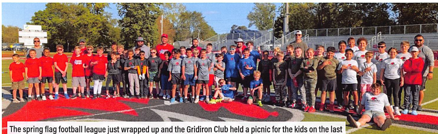
The spring flag football league just wrapped up and the Gridiron Club held a picnic for the kids on the last day of games. It was a good turnout of elementary aged kids with 6 teams in each of the two age groups.